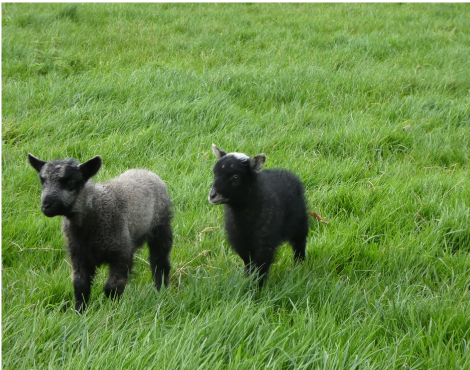
Spring lambs behind Springfields