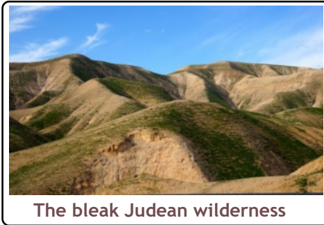
The bleak Judean wilderness

O NE of the things which sets Christianity apart from other belief systems is belief in the Trinity — God in three Persons. The Bible very clearly states that Jesus was God. He said “I and the Father are one.” ( John 10: 30 ), and “Anyone who has seen me has seen the Father.” ( John 14: 9 ). In Jesus, God lived on earth as a man. At Christmas we celebrated His birth. Now, as we approach the season of Lent, we will be reminded that Jesus grew up and, like us, faced life’s challenges.